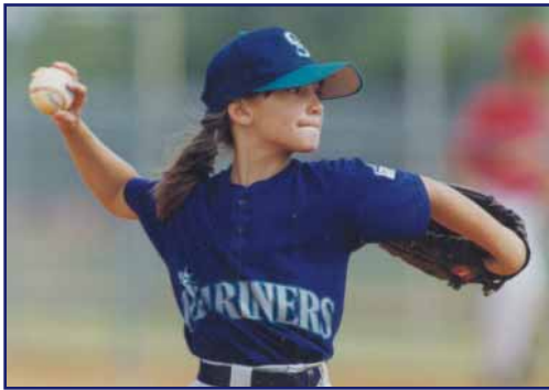
Sportsmanship in Youth Sports