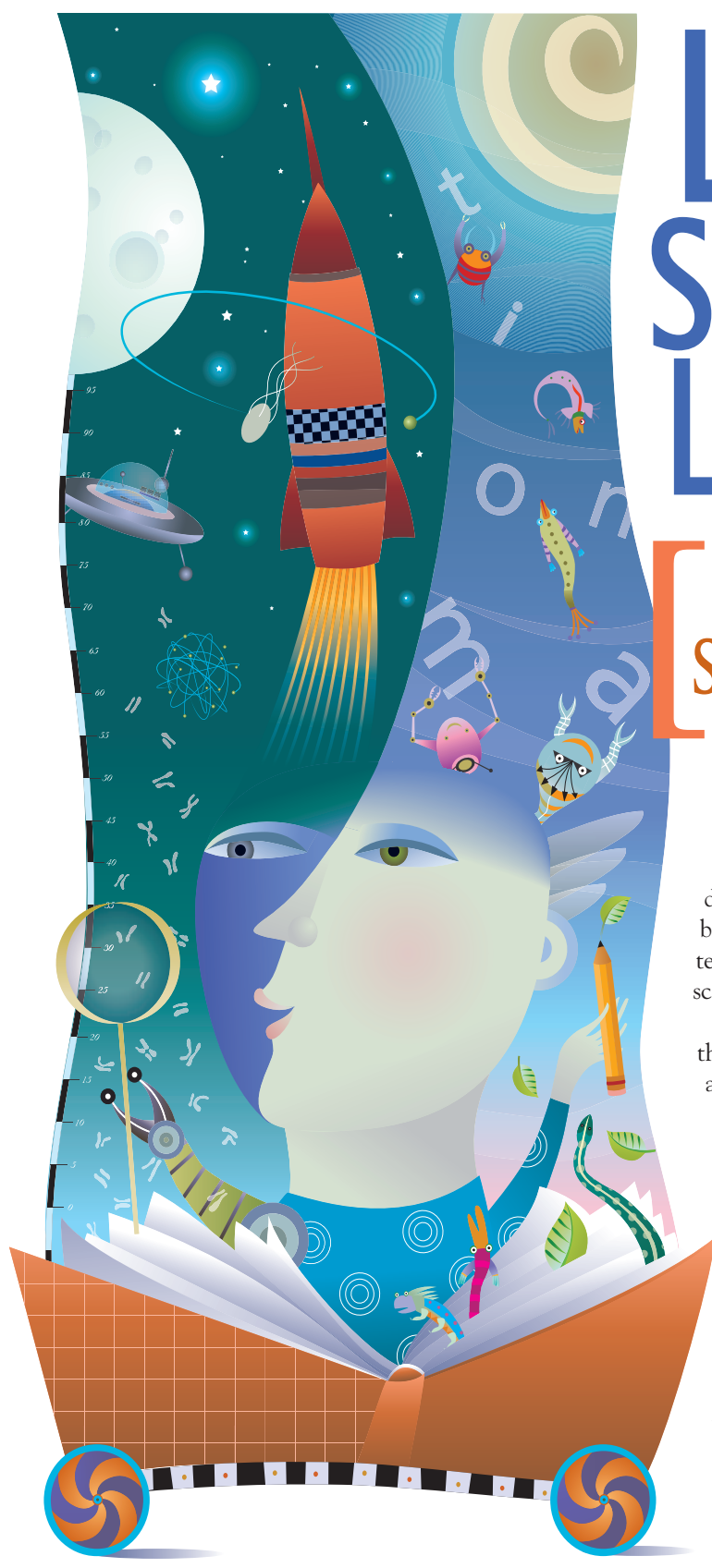
ILLUSTRATIONS: CHRISTIANE BEAUREGARD