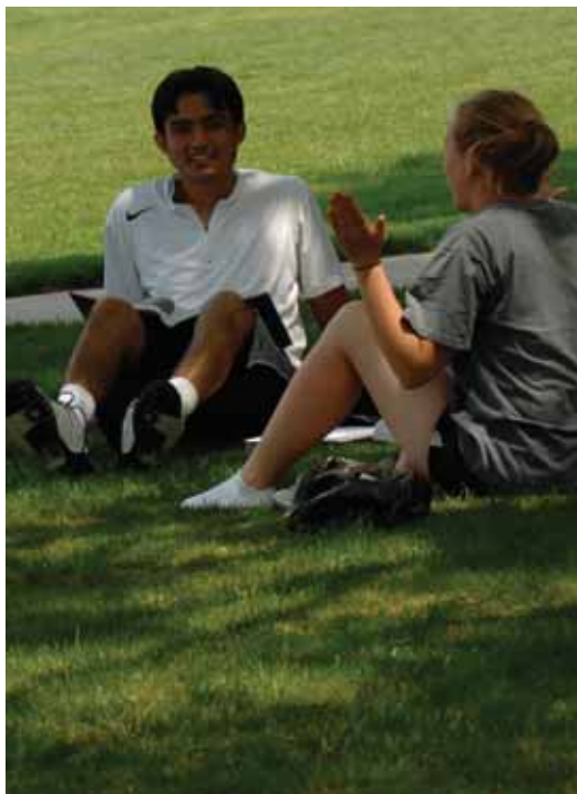
Old Dominion University

Be willing to work behind the scenes. Leadership efforts cannot always be out in the open. Many faculty members work behind the scenes with students who protest or take direct action. Faculty members might also tip off the newspaper, work informally with a community agency, or participate in an undisclosed network. Often, faculty feel called to participate in leadership efforts for which they cannot receive formal credit and of which most people are not aware. Leadership on controversial issues needs to be thought through carefully in the pre-tenure years. While some faculty members choose to participate less in “invisible” leadership until after tenure so that their pre-tenure efforts are credited, others make the opposite argument: participation behind the scenes protects faculty during the pre-tenure years.