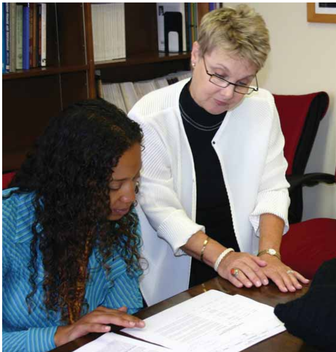
University of Southern California

At one campus we studied, for example, students in a course on environmentalism and sustainability examined ways their institution