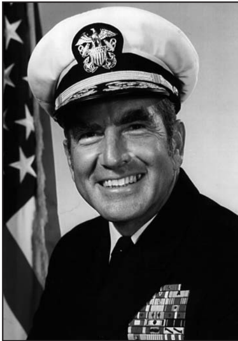
Admiral Elmo Zumwalt

Let us look more carefully at our students and treat them as the future leaders of our nation and the world. Let us more seriously consider the magnitude of our good fortune and responsibility as teachers of those who will guard our nation’s safety,