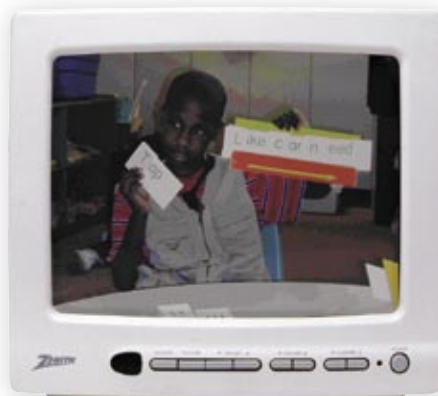
One King Center student wears a vest that allows the classroom camera to monitor that student's activities.

Each classroom, for example, is equipped with three to four desktop computers to be used for in-class research and enrichment activities. In addition, the full-time technology coordinator provides both computer lab sessions for groups of students and whole class sessions where each student has his or her own laptop for learning. The coordinator also assists