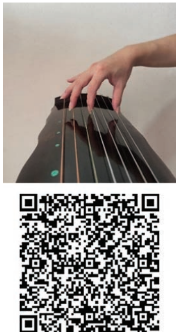
Figure 7. Techniques: “Pa Yin”