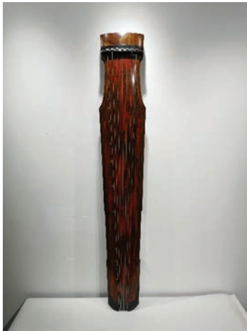
Figure 3. Zhongni style Guqin