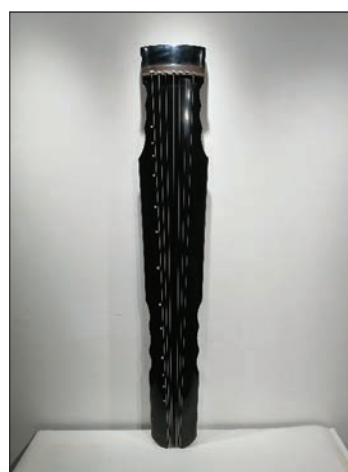
Figure 2. Lianzhu style Guqin