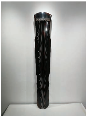
Figure 4. Fuxi style Guqin

philosophical concepts. The pieces exhibit a straightforward yet profound melodic structure, highlighting harmony and balance in alignment with traditional Chinese principles. This engenders a sublime and contemplative quality that has historically attracted researchers and intellectuals. The Guqin's elongated and flat design generates a rich, resonant tone, predominantly focused in the middle and lower tonal registers. This distinctive timbre amplifies the instrument's reflective and meditative essence (Shen et al., 2022).