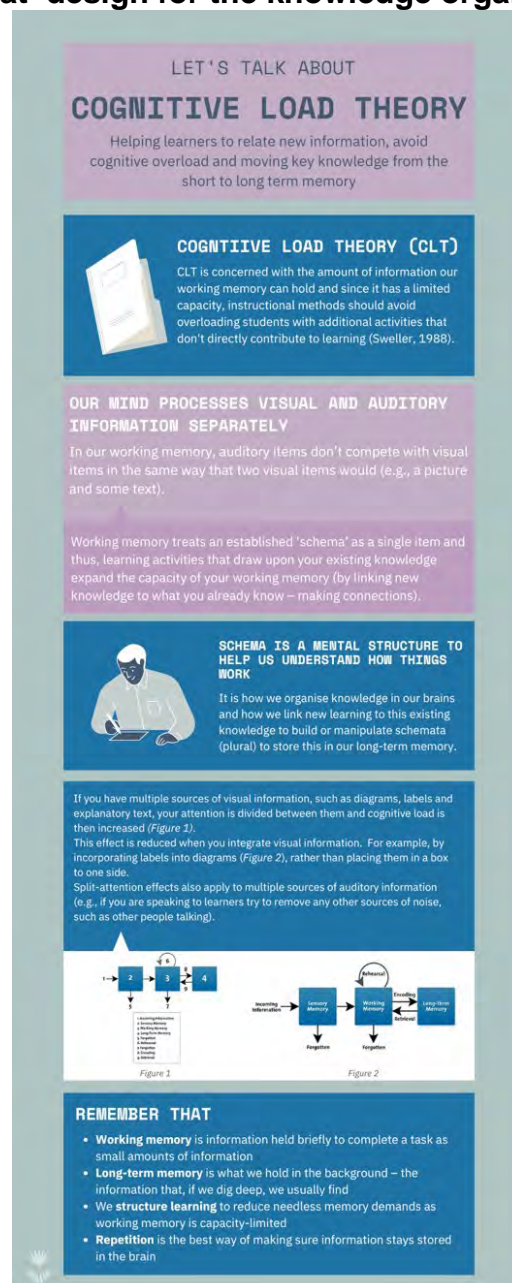
Image 2. Initial 'Learn That' design for the knowledge organiser.

The DBR approach is inherently flexible, allowing for ongoing refinement based on real-world feedback. This cyclical process of design, implementation, and refinement ensures that tools like the Passports are both practically effective and theoretically grounded.