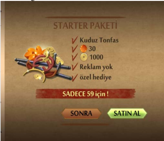
Image 8. Shadow Fight In-Game Purchase