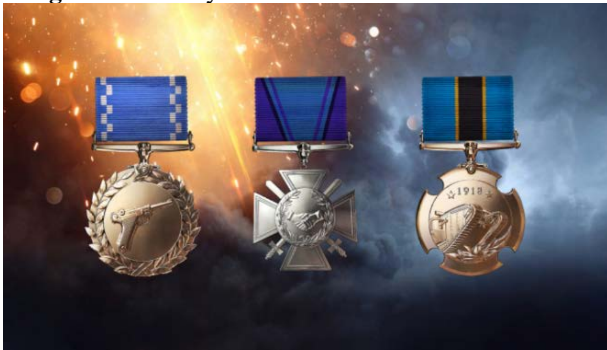
Image 9. Battlefield In-Game Rank-Increasing Medal Rewards