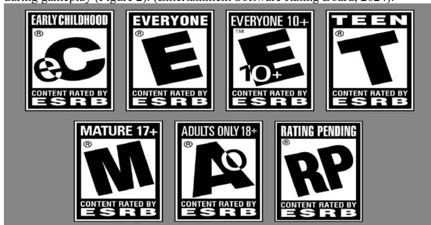
Figure 2. ESRB Digital Game Content Identifiers

The ESRB was established in 1994 in the United States with the aim of evaluating and classifying digital games for the interactive entertainment software industry, as well as creating advertising guidelines and online privacy principles. It is considered the first initiative worldwide in the field of digital game rating. ESRB has developed content descriptors in 30 categories to inform users and/or parents about the nature of visual and auditory elements contained in the game's content. By utilizing these descriptors, individuals purchasing the game and/or parents can obtain preliminary information about potential situations they may encounter during gameplay (Figure 2). (Entertainment Software Rating Board, 2024).