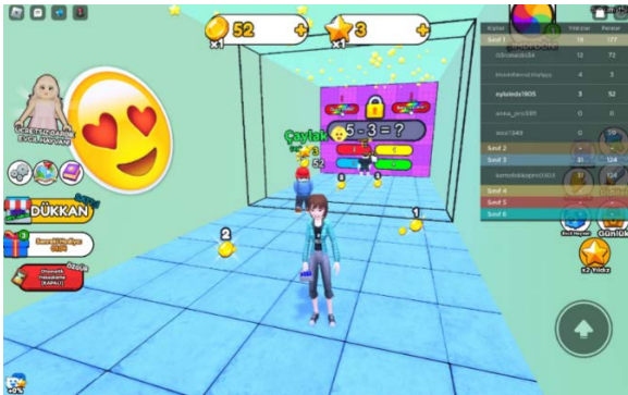
Image 1. Roblox Skill Development Goal

According to Table 5, when the objectives of the digital games preferred by children are examined, it is observed that the games mostly involve the objective of "fighting against enemies." Additionally, among the objectives of the games preferred by children, survival, completing specific missions, and developing tactics are also prominent. Table 6 provides in-game communication.