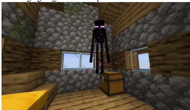
Image 5. Creature in Minecraft

When examining Table 8 for elements of horror in digital games, it is observed that many games played by children include creatures, visuals, and sounds containing horror elements, along with numerous scenes of killing or injuring. For example, in the game Minecraft, when examining the horror elements, the creature called Enderman attacks the player when they look at its upper legs, body, or head. Another creature, Creeper, approaches the player from behind and explodes to kill them. Table 9 provides encouraging in-game consumption.