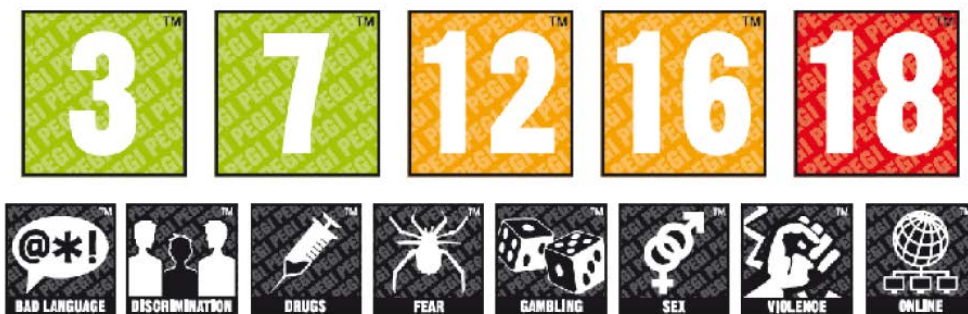
Figure 1. PEGI Gaming Age Rating System and Risk Symbols

The ESRB was established in 1994 in the United States with the aim of evaluating and classifying digital games for the interactive entertainment software industry, as well as creating advertising guidelines and online privacy principles. It is considered the first initiative worldwide in the field of digital game rating. ESRB has developed content descriptors in 30 categories to inform users and/or parents about the nature of visual and auditory elements contained in the game's content. By utilizing these descriptors, individuals purchasing the game and/or parents can obtain preliminary information about potential situations they may encounter during gameplay (Figure 2). (Entertainment Software Rating Board, 2024).