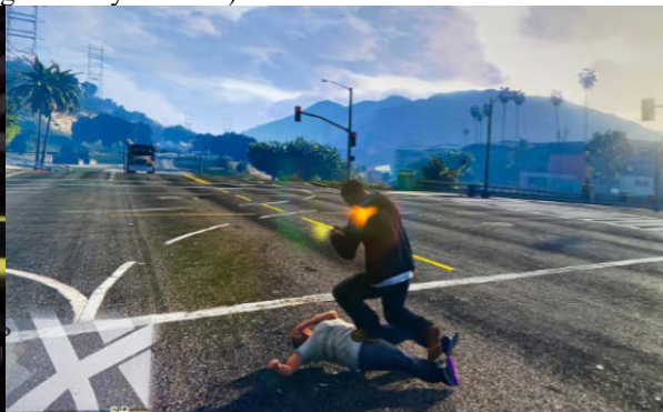
Image 4. Physical Violence in GTA5