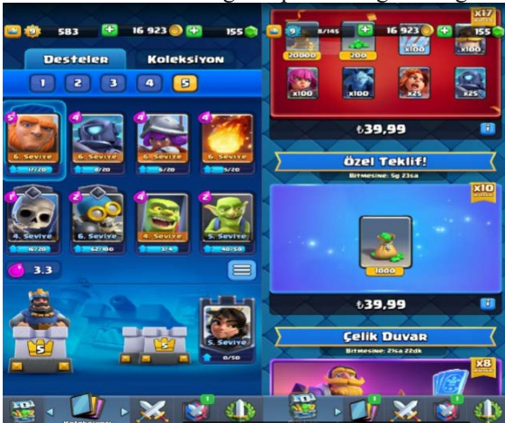
Image 7. Clash Royale In-Game Purchase

the game Zula, players can watch ads to earn extra rewards. During these ads, one of them promotes another game featuring elements of violence against women and children. The second advertised game promotes gambling-related betting ads. women and children. The second advertised game promotes gambling-related betting ads.