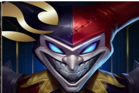
Image 6. Character in League of Legends