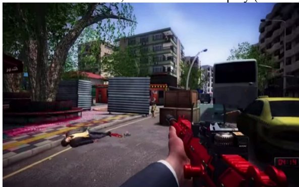
Image 3. Use of Weapons in Zula

Jinx: "Shot the sheriff, didn't touch the deputy (referring to Caitlyn and Vi)."