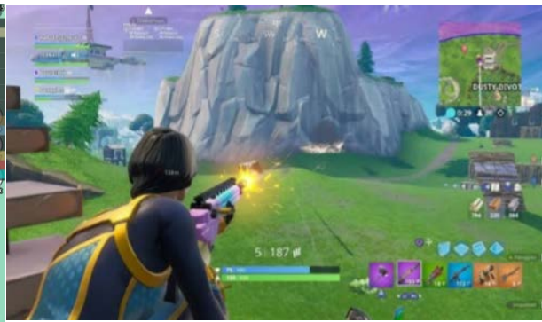
Image 2. Fortnite Survival Goal