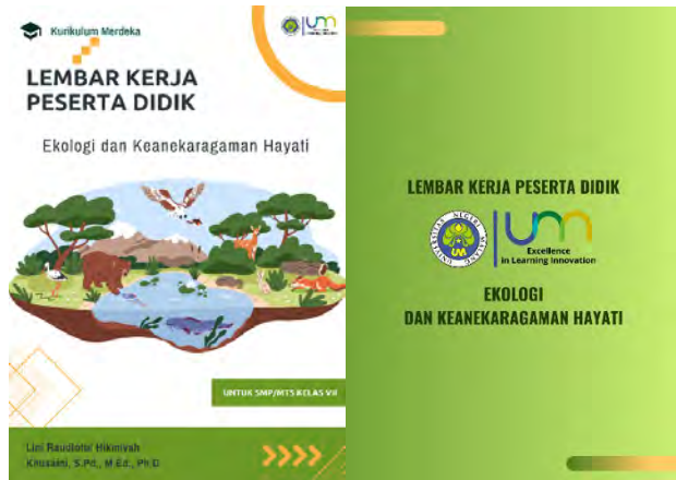
Figure 2 Design front and back cover of the LKPD