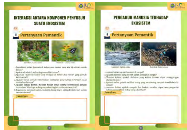
Figure 3 Trigger questions at the beginning of each sub-material

In addition to use triggering questions (Figure 3), the developed LKPD also applies the syntax of the Problem Based Learning model because it is considered to encourage a sense of interest, and requires students to actively participate in solving problems by finding answers to understand a concept of learning material, so as to build student motivation (Zaraturrahmi, Adlim, & Zulkarnaen, 2016). There are five PBL syntaxes applied in this LKPD, namely orienting students to the problem, organizing students to learn, guiding individual and group investigations, developing and presenting results, and analyzing and evaluating the problem-solving process. The developed LKPD is also equipped with articles and videos of problems related to concrete events experienced in life, so that students are expected to find solutions to the problems given and apply the solutions designed in life to preserve their environment. There are three problems included in the ecology and biodiversity LKPD, namely the problem of the exploding caterpillar population caused by