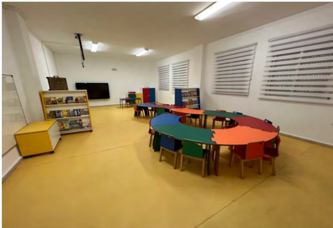
Figure 2. Recently renovated classroom at a primary education centre in the autonomous city of Ceuta.

Transforming students into active participants in their learning process (Parra-González, Segura-Robles, Cano, & López-Meneses, 2020; Valdivia, 2010) will be the main ingredient to achieve real methodological innovation in classrooms. This educational innovation relies on the educational space as an essential tool in the teaching-learning process providing students with an educational environment that fosters social relationships, a productive climate and actively involves all members of the educational community.