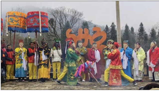
Figure 3. Nuo dance “Dancing Umbrella Money”