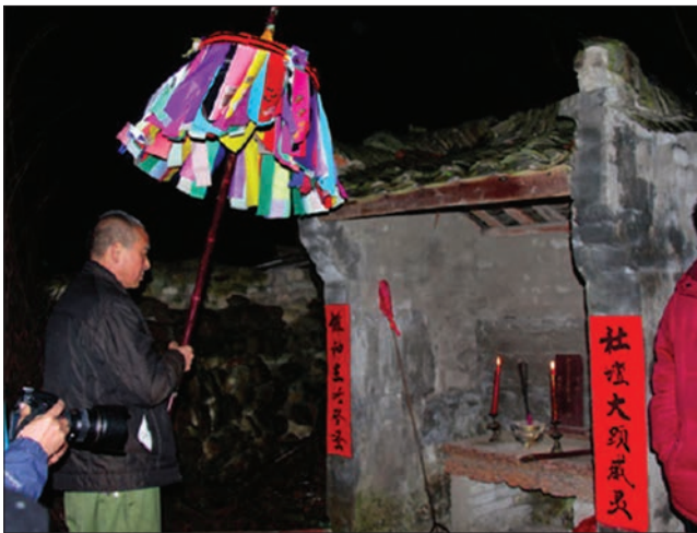
Figure 2. “Lifting the Holy” Ceremony