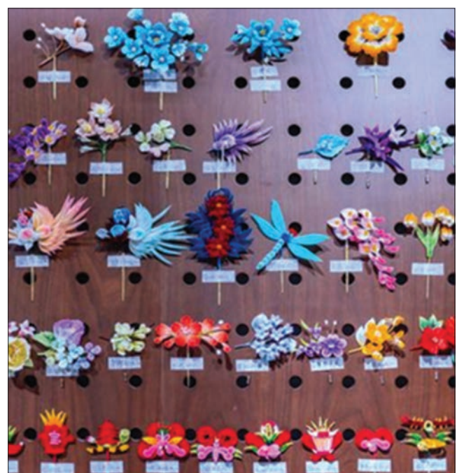
Figure 1. Nanjing Velvet Flower

In the course activities, students experience and practice four main steps: (i) Hooking, or “rolling.” According to the needs of the production of works, the different colors and