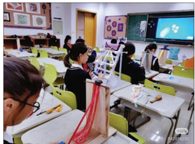
Figure 2. "Nanking Velvet Flower" aesthetic education program

The concept of quality education was first formally put forward in China in the late 1980s and early 1990s, mainly in