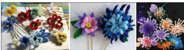
Figure 4. Students' works

In order to make the technique of the velvet flower get adequate protection and development, the Nanjing velvet flower