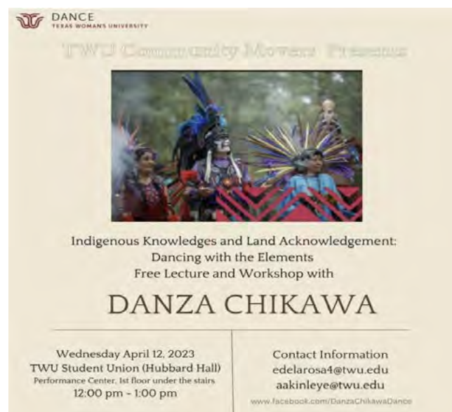
FIGURE 3. A flyer announcing the lectures, workshops, and performance pieces that were performed by faculty and students alongside Danza Chikawa, April 2023.

Fall 2023–Present: The Division of Chemistry and Biochemistry is part of an NSF-funded project (NSF #2040991), "Transcending Barriers for Success," which