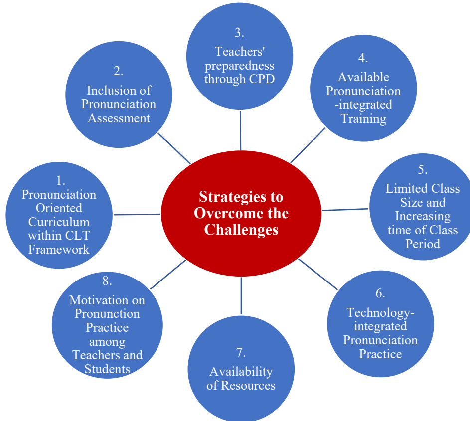
Figure 3. Strategies to Overcome the Challenges of ESL Pronunciation in Bangladesh

The diagram below presents various strategies to overcome challenges in teaching English as a Second Language (ESL) pronunciation in Bangladesh. Here is an explanation of each strategy: