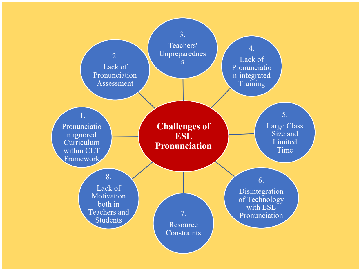
Figure 2. Challenges of ESL Pronunciation in Bangladesh

The diagram below highlights key challenges in teaching English as a Second Language (ESL) pronunciation in Bangladesh. Here is an explanation of each challenge: