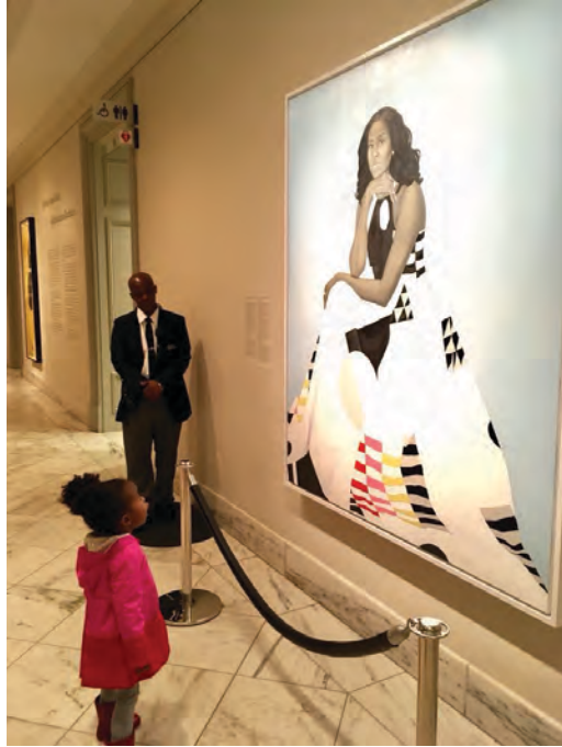
2c: Portrait of Michelle Obama, National Portrait Gallery, Washington, D.C.