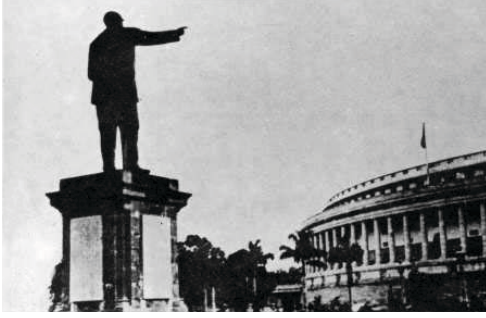
2a: Statue of B. R. Ambedkar, Parliament House, New Delhi