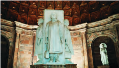
2b: Statues of Dalit leaders in Lucknow, Uttar Pradesh