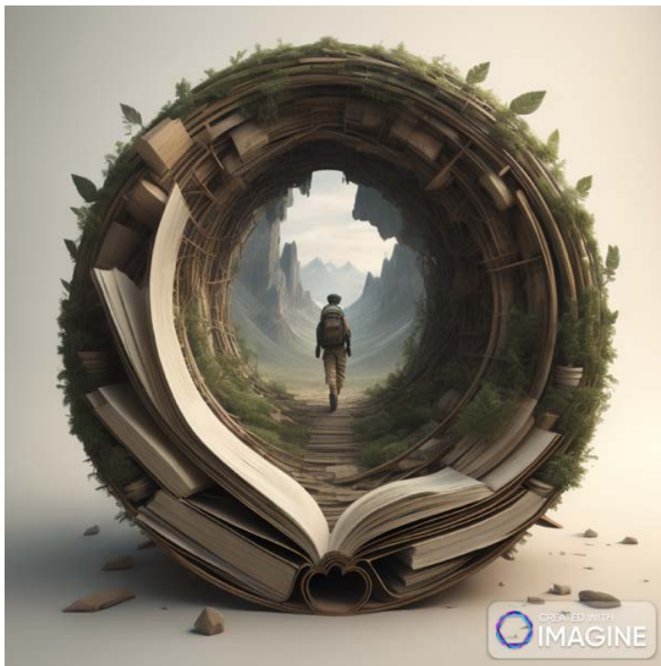
Image Representing Chapter 32 Titled “Expanding your NoleJ” (ETAD 402, 2023)

To facilitate the writing process, a template was provided to guide the teachers in authoring well-balanced chapters that analyzed the affordances, constraints, and tensions associated with AI education (Table 1). We assigned the textbook a Creative Commons Attribution Non-Commercial Share Alike 4.0 International Licence (CC-BY-NC-SA-4.0); however, GAI images are uncopyrightable. Building on Sullivan et al.’s (2023) research into ChatGPT, academic integrity, and student learning, we asked each teacher to be transparent in documenting the role of GAI in their assignments. For example, one author acknowledged: