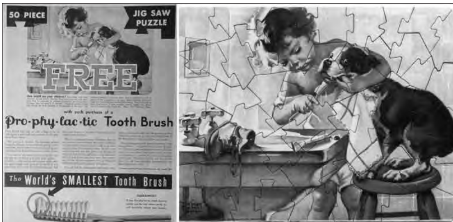
Figure 1. Lambert Pharmacal advertised its toothbrush and its puzzle giveaway in multiple issues of the Saturday Evening Post and other popular magazines in July 1932.

As the economy declined, interest in jigsaw puzzles rose. In response, the major puzzle companies increased production and issued catalogs more frequently. Parker Brothers, for example, doubled its employment of puzzle cutters between 1928 and 1931. (Williams 2004). At first, people did traditional wooden