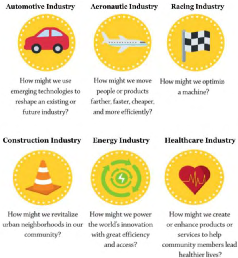
Figure 2. Example Design-Cycles

with a new design challenge partnered with an industry entity and concluding with an idea pitch to that partner. These design challenges integrate state academic standards, prompting students to tackle challenging questions, develop prototypes, and craft business models. At the end of each cycle, student teams pitch their solutions to a variety of school, community, and industry stakeholders. This design-based learning approach encourages students to solve authentic, complex, and multifaceted problems.