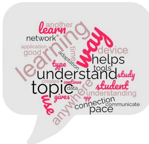
Figure 4: AEET for distance education

Figure 4 shows that the words most frequently related to the question, “Does the use of AEET facilitate the distance education?” were: understand (n = 12), path (n = 10), learning (n = 9), topic (n = 7), use (n = 6), anywhere (n = 5), help (n = 5), and learn (n = 5).