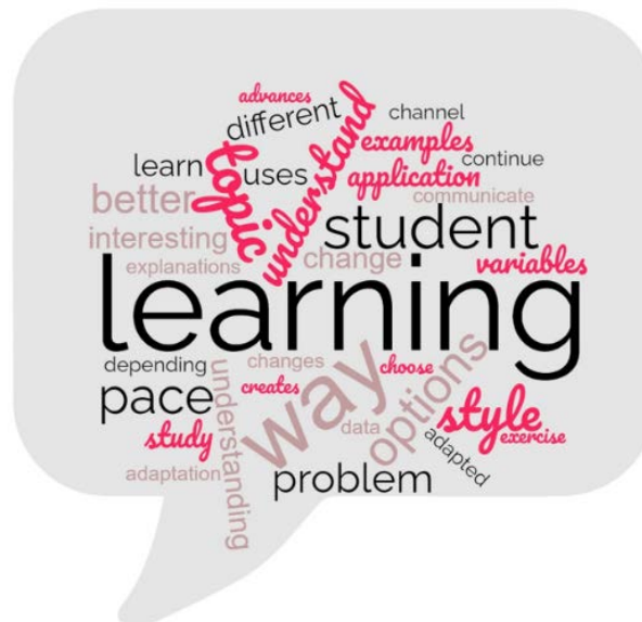
Figure 3: Personalisation of learning through AEET

Figure 3 shows that the words most frequently related to the question, “Does the use of AEET allow the personalisation of learning?” were: learning (n = 17), understand (n = 9), way (n = 9), student (n = 6), topic (n = 6), options (n = 5), pace (n = 5) and style (n = 5).