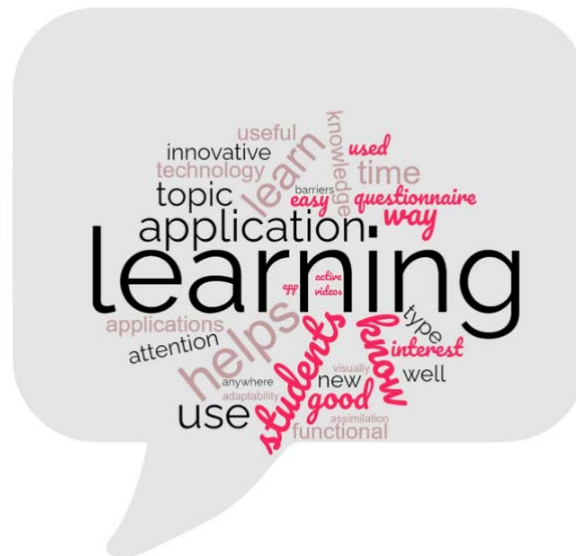
Figure 2: Benefits of AEET in the educational context

Figure 2 shows that the words most frequently related to the question “What are the benefits about the use of AEET?” were: learning (n = 15), students (n = 8), helps (n = 5), application (n = 4), know (n = 4), learn (n = 4) and use (n = 4).