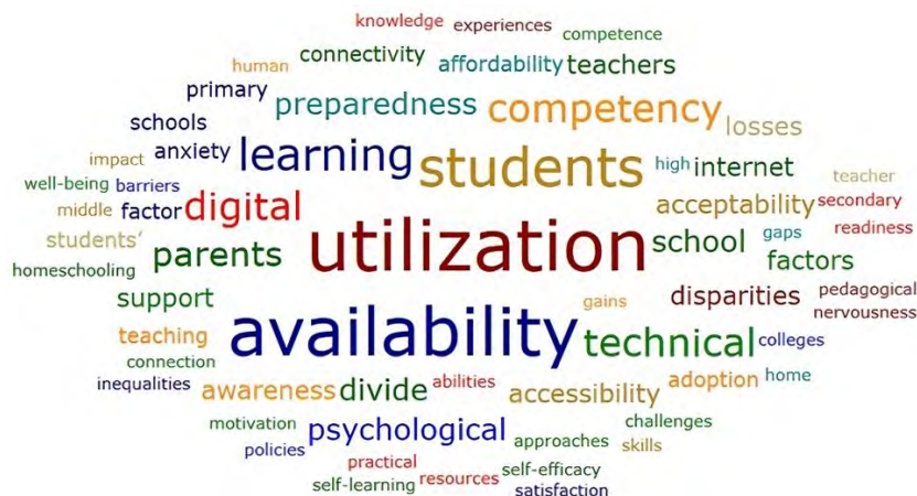
Figure 2. Word cloud of e-learning critical variables

Overall, the study suggested some critical variables which made it possible for the adoption of e-learning and migration to online learning or discourage the smooth migration to online learning. These variables gave rise to the framework for successful implementation of e-learning in times of global disruptions such as the COVID-19 pandemic and other natural disasters which could hinder face-to-face interactions or teaching. Figure 2 shows a word cloud of these critical variables as extracted from the reviewed literature.