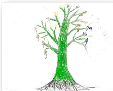
Note. Yun, The tree of growth. This image symbolizes Yun's personal and academic growth while studying CAT.