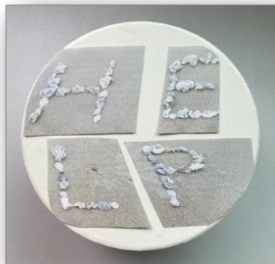
Note. Han, Help. This image reflects Han's frustration due to unprepared language.