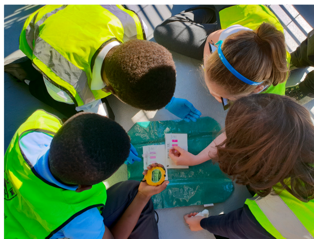
Figure 2. Primary (elementary) school children investigating the pH of river water.

In the U.K., science is a core subject at primary or elementary school, but the perception is that teachers, who have to teach all subjects, are not confident in teaching science and that the experience for children is rather limited. The Primary Science Teaching Trust 42 is a charity that runs the U.K. primary science teacher of the year award annually, and around 10–20 teachers are awarded such a prize and invited to become Fellows of a virtual college. These teachers have a wide range of science qualifications—from the basic GCSE (U.K. pre-16) through to a Ph.D. in a science subject—and teach across all key stages and year groups. Therefore, some award winners have been experienced scientists, but some are not. The awardees teach children as young as 4 through 11, which is typically the oldest age at U.K. primary schools. Hence, these teachers are not "expert" scientists focused on teaching just 10–11 year olds. What makes these teachers so good? Time and time again, watching these teachers teach, some characteristics emerge. They find good contexts (see Figure 2 ) and are able to utilize the culture of the children in their class. They are also skilled in using the wider curriculum to incorporate scientific knowledge and understanding. An example of this