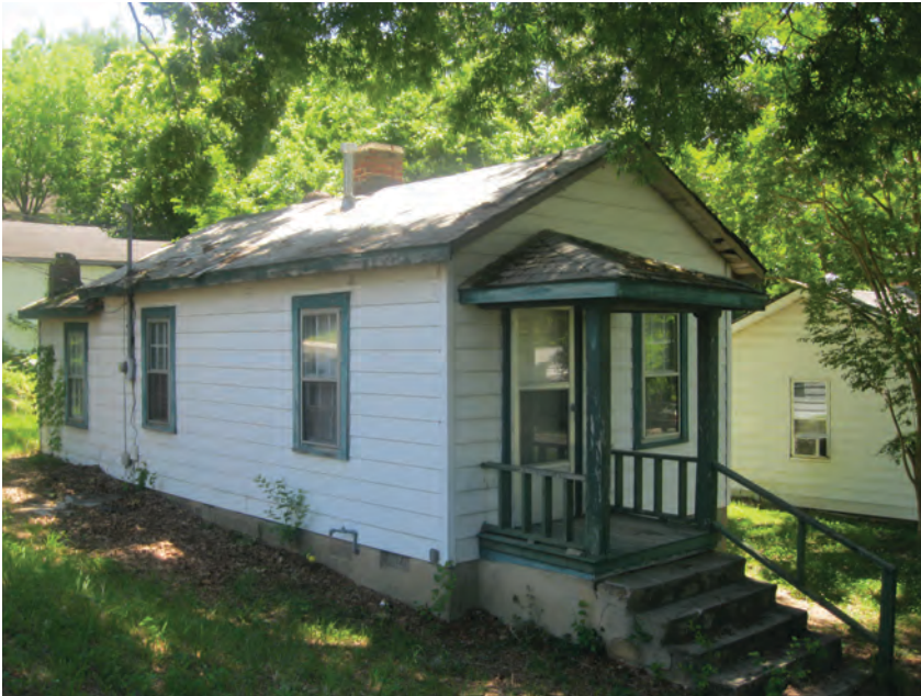
Figure 2. Typical home in the Northside neighborhood.

But by the 1990s, the contours of the achievement gap and racial segregation in Chapel Hill