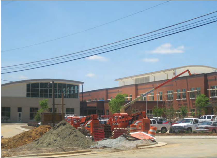
Figure 4. The new Northside Elementary School under construction in the historic Northside neighborhood.