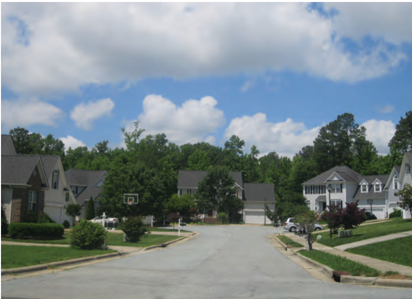
Figure 1. Suburban homes in the “74A” neighborhood, where Asian Americans slated for redistricting were clustered.

Nearly all those whom I contacted agreed to be interviewed and many referred me to others to form a rolling sample of participants. Section 74A parents active in the debate were particularly difficult to locate from secondary data. Several interviewees were introduced to me by