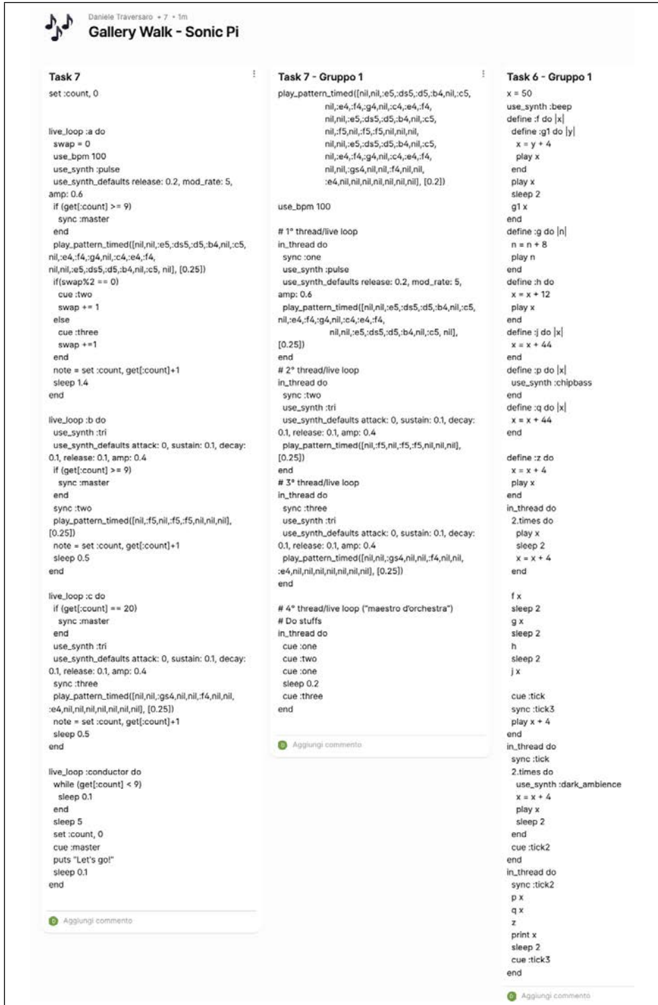
Fig. 15. Team Task 6 and 7 Solutions.