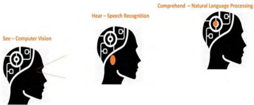
Figure 2. Attributes of AI

inputs, and output (see Figure 2) (Rouhiainen, 2018).