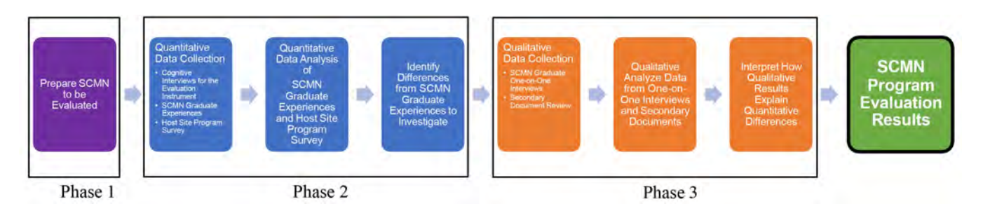
Figure 1. South Carolina Master Naturalist Program evaluation, mixed-methods design.

The final evaluation instrument was sent to 2,149 SCMN graduates to survey on the state level. The evaluation instrument was developed by following the tailored design method (Dillman et al., 2014) and deployed by using Qualtrics<sup>®</sup>. An email invited SCMN graduates to participate in the survey, and three reminder emails were sent before the survey was closed. Simultaneously, another Qualtrics<sup>®</sup> survey was sent to the six host site coordinators, asking for information related to program implementation. We requested syllabi, reading materials, quizzes/tests, number of instructors, and maximum number of students per class. Email reminders with a link to the survey instrument were sent directly to the host site coordinators who had not responded after 2 weeks.