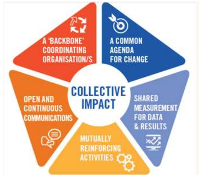
A Conceptual Map: Five Conditions for Collective Impact