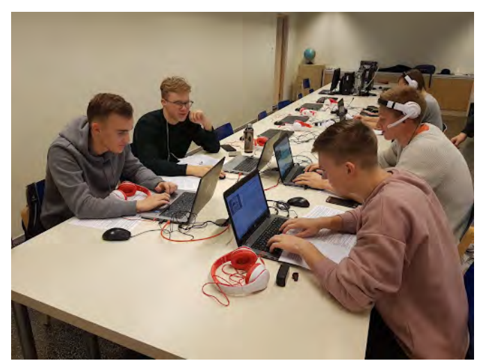
Figure 2. Typical Classroom Setup Used for Data Collection in the Present Study

the activities, the teacher was present in the classroom and carried out routine tasks involving monitoring groups' activities and offering help when needed. Students were in the same classrooms and instructed to use headphones primarily capturing high-quality audio through microphones. Teachers seated students based on the classroom's logistics. Participants from the same group sat close to each other. Figure 2 shows a group of students during the activity.