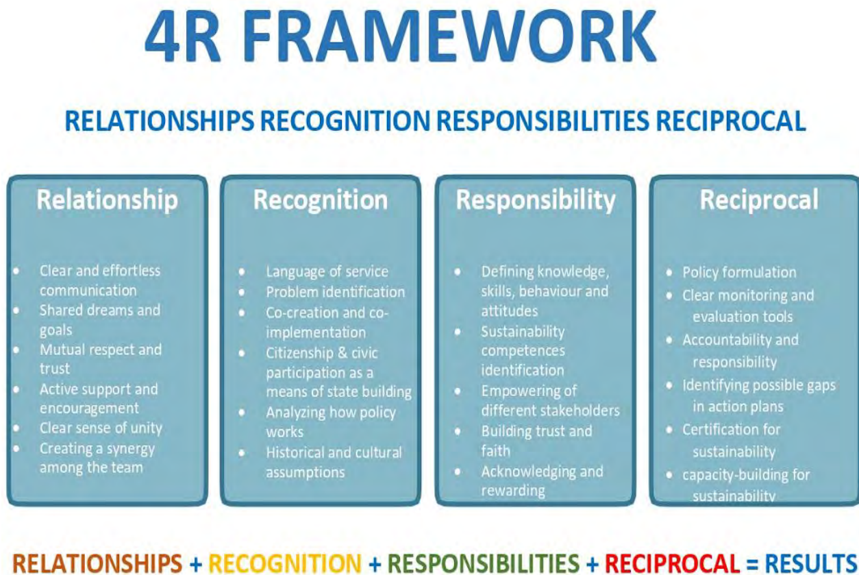
Figure 1. The 4R Framework