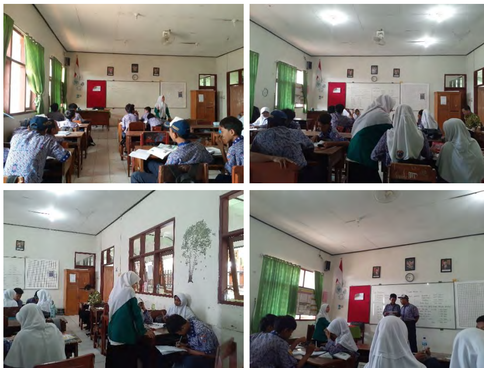
Figure 3 Students' activity during the experimental learning between students who follow the situational problem-based learning model with SESD approach and students who follow the traditional learning model in the 8th grade, face-to-face takes place in SMPN X Ponorogo.

Beside that the results of the data analysis show that the average problem-solving skills of students who follow the problem-based learning model with SESD approach is 82,63 higher than 75,72 of the group of students who follow the traditional learning model.