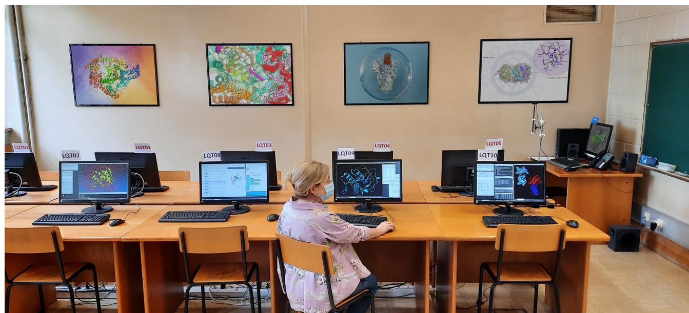
Figure 2. A professor helps a student to perform docking calculations. The student is working from home on computer LQT09. The figure also shows the sessions of the students at computers LQT07–LQT10. The professor moves from computer to computer in the classroom, working directly with the students during their computer sessions. Communication is made through Zoom (panel situated on the right-hand side wall of the lab, hidden in the photograph); the students can hear the professor from any place in the classroom. The laboratory dynamic is very much the same as during the pre-COVID-19 era, with the difference that the students sit at home!

docking and virtual screening can be performed intuitively and pedagogically. vsLab was explicitly developed for classroom use and is free of charge, just like Autodock4 and VMD. After performing molecular docking, the students analyze the interactions between varespladib and the enzyme (Figure 1B).