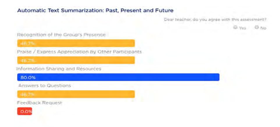
Figure 2. Collaboration per forum.

The proposed tool also contained learning analytics that could be accessed only by instructors, with details on the collaboration analytics per forum and per student and the similarity among posts. Figure 2 presents the level of collaboration analytics from a specific forum. It was also possible to visualize the same information for each student. Such information could aid the formative evaluation and to measure student participation in the online discussion.