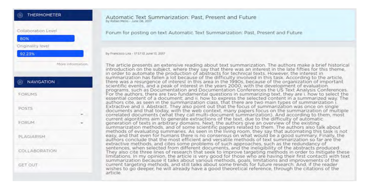
Figure 1. Proposed educational forum.

The results show that the adoption of the GA enhanced the F-measure for all the classes. We highlight the improvement in the class "question", raised from 87.40% to 97.80% and from 28.30% to 54.90% for S1 and S2, respectively. Besides, S1 outperformed S2 in all cases. For example, S1 improved the result of the identification of "question" in 77.04%, showing the proposed method's efficacy. The combination S1 (SVM+GA) reached better results than the others.