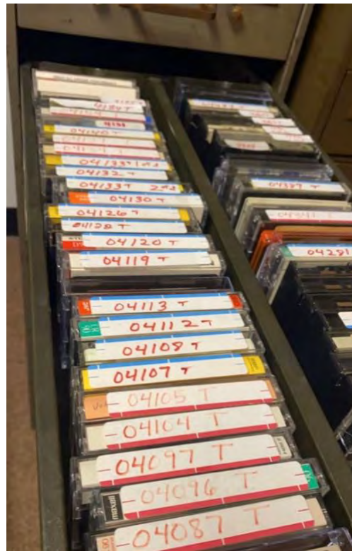
Image 5. Cassette tapes featuring student-conducted interviews from the SEP Collection.

https://guides.libraries.psu.edu/c.php?g=1082288&p=8002156