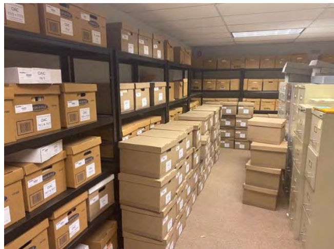
Image 4. The CFS Folklore Archives and the SEP Collection recently underwent a move, pictured here, and can be accessed by contacting the OSU Folklore Archives.

Like Lovejoy’s students, Christensen’s students remarked on the validating effects of self-documentation, an increased appreciation for the past’s relevance to the present, and a sense that competent fieldwork and writing was within their ability. Careful structuring of the timing and products of archive visits is crucial to developing this student confidence and capacity—and it also helps to maximize the efficacy of all-too-short archive visits, especially if an archive relies on nondigitized materials and minimal staff.