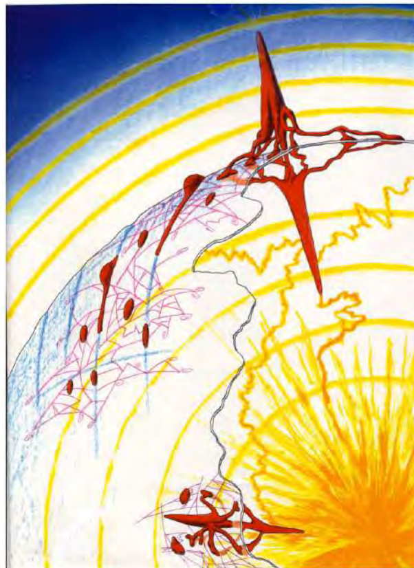
Figure 3: A Visual metaphor showing the nature and dynamics of academic research and theory development. (from Ambrose, 2024a)

The complete description of this IOWS is many pages long and cannot fit into this manuscript. The more complex description connects the image with thousands of pages of research and theory. This IOWS is one of many included in a volume on visual metaphor (see Ambrose, 2024a).