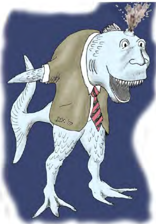
Figure 1: A concept cartoon illustrating the dogmatic thoughts and actions of professional ideologues who work in think tanks. (from Ambrose, 2009a)

He swims around in an ideologically extreme think tank. While swimming he thinks up thinky things that pile up in his cranium in the form of narrow-minded, shortsighted, superficial, rigid, dogmatic mind pebbles. When the pile generates too much pressure he has a dogmatic mind blowout through the hole in the top of his tiny cranium. When that happens, his think-tank bosses send his mind pebbles to the fake news outlets of the nation so they can spread them out into the dim minds of their ideological followers.