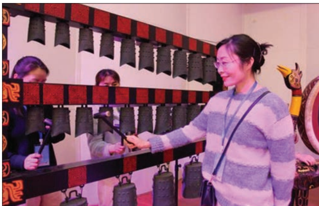
Figure 5. National training students experiencing ancient instrument performances

One student, previously focused on percussion, found a newfound interest in Bian Zhong's bell performance after joining a rehearsal class. They highlighted learning cultural knowledge, mastering performance techniques, and actively participating in performance activities, which helped them spread awareness of Chinese cultural heritage.