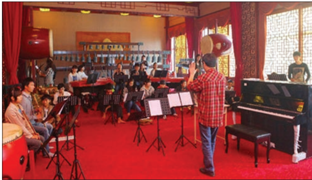
Figure 3. Rehearsal work Su Hang 2015

In the realm of musical practice, etudes play a pivotal role as pieces of music crafted to refine performance techniques. These compositions typically focus on specific technical aspects, aiming to enhance particular areas of musicianship. At the School of Music, the teacher devised a series of Bian Zhong etudes inspired by the distinctive traits of Xu Gongning Bianzhong. This innovative approach significantly contributed to the improvement of students' learning outcomes and mastery of Bian Zhong's performance techniques, as shown in Figure 4.