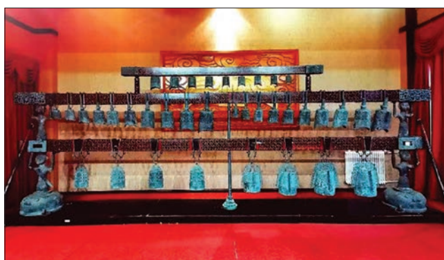
Figure 2. Xu Gongning bianzhong used by the School of Music, Pingdingshan University

The transmission of Xu Gongning Bianzhong in classroom teaching at Chinese universities is a comprehensive process embedded within a structured teaching system. This system encompasses various elements such as knowledge structure, teaching content, methods, process, and evaluation. One crucial aspect of this system is the course credit setting, exemplified by the “Grace Training” professional elective course offered by the School of Music, which adopts a “modular” curriculum system. This course belongs to the regional music culture module and includes band training, dance team training, and singing team training, with Bian Zhong courses integrated into the band training component. By teaching traditional Chinese ritual music culture