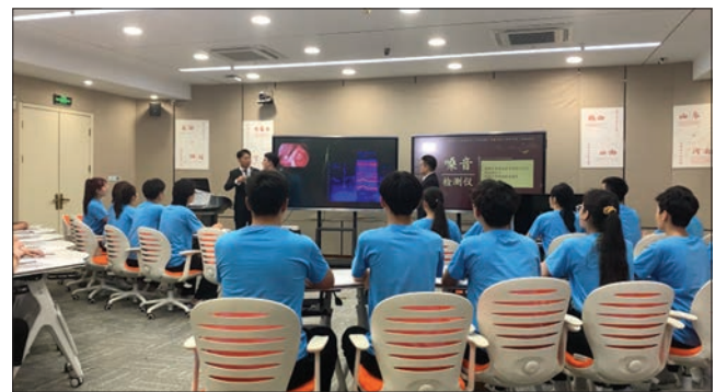
Figure 2. Analysis and dissemination of singing skills in Luoyang Quju Opera