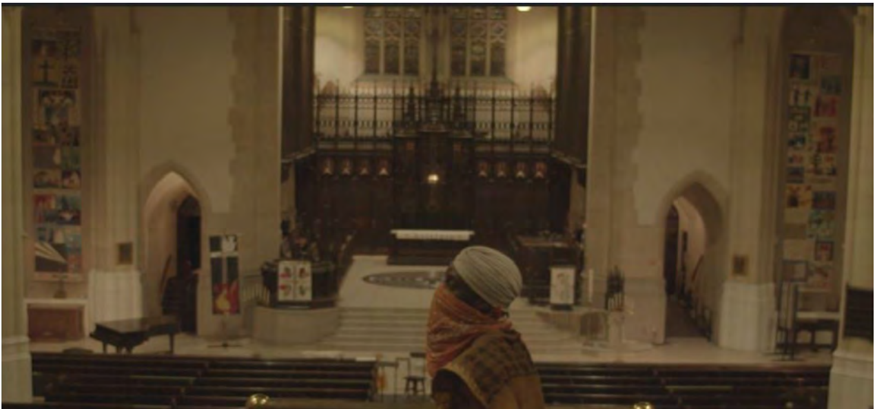
Fig. 6: Indica; Omega video shoot, Metropolitan United Church.

Ayrah questions potentially overly benevolent ideas of arts for social change. He reminds us that community programs do not create culture; rather, they harness and help support changemakers as part of a much broader resistance. And he highlights that community initiatives operate within inequitable systems that are themselves challenged to properly combat processes of marginalization (Lombardo et al., 2023). The unique role and need for culture from the "margins" is bound up in existing and ongoing processes of social change. Community arts projects seek to tap into this energy but can also risk objectifying and appropriating. Ayrah calls us into the space of an artist hungry for opportunity, for audience, and for expression. He spotlights and problematizes the re-centering notions of community arts from both perspective and resistance at the margins.