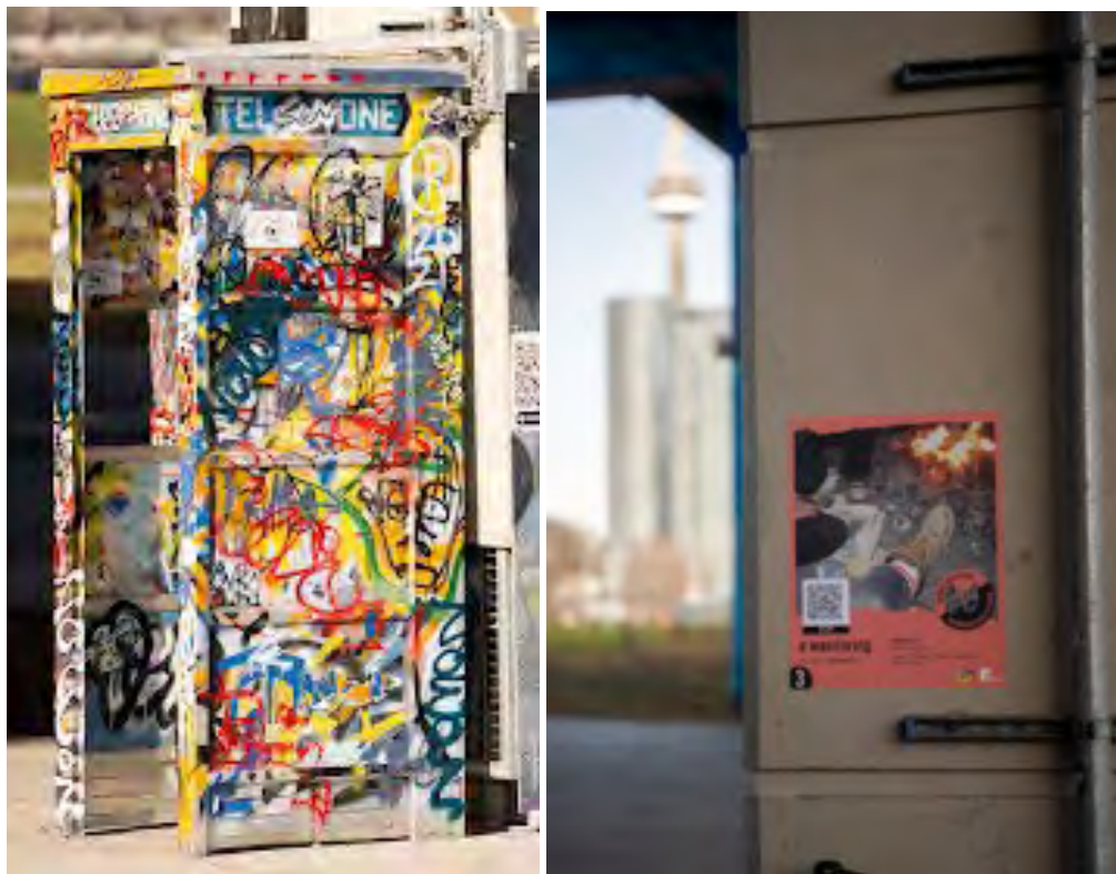
Fig. 3: A Wandering installation. Left: phone booth to listen to stories or leave one's own Right: QR code for accessing digital stories, augmented reality images and videos

Cities are enriched by street artists, and homeless community culture is vibrant and thrives despite ongoing displacement and so much loss. Partnerships like this recognize this community's hidden legacies, wisdoms and histories, yet they're often not valued as contributions to community or city development. This needs to change. Toronto must recognize its many hidden histories—so HEAR US in the place we call home.