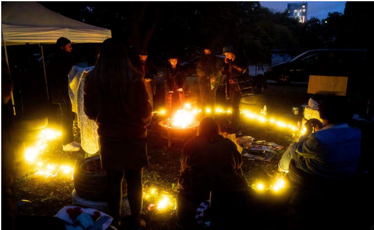
Fig. 2: Queering Place talking circle gathering—sharing thoughts and “inQueeries”

Can we just gather? Can we commit to showing up? Can we make space for what is wanting to be built? Can we prioritize just being in space with one another?