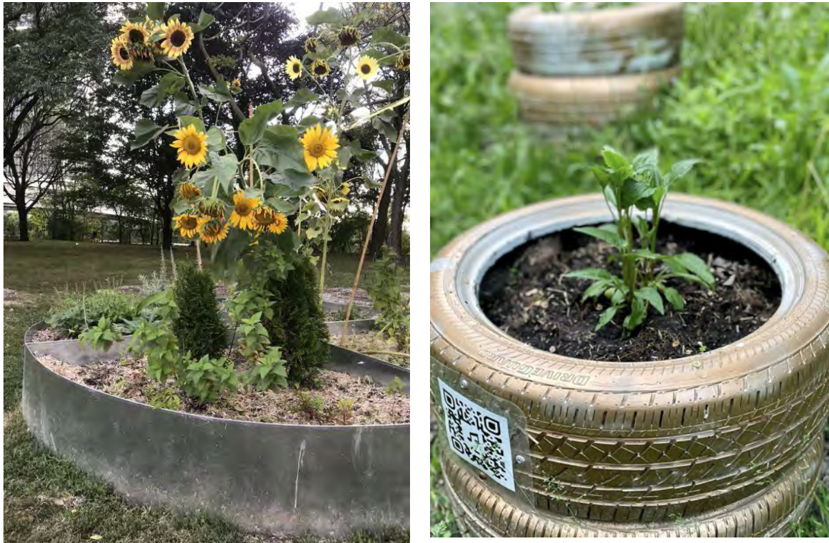
Fig. 1: Queering Place earth-art installation. Left: medicine wheel garden.

futures, embracing fluidity, expressing a broader, more inclusive understanding of the social system that we're trying to change.