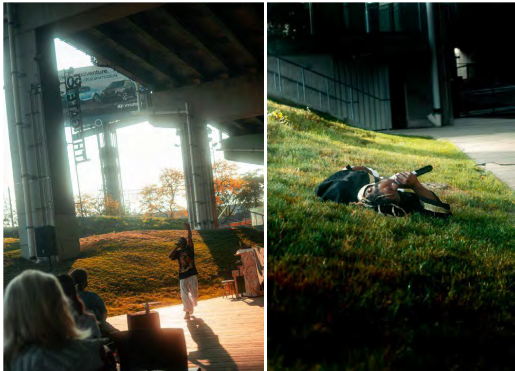
Fig. 5: Indica; Omega performance at The Bentway, by Ayrah Taerb (2021).

Hip hop has a history, a genesis, in responding to, reflecting and resisting processes of marginalization. Claiming space, for black men in particular, to enact power and care within their communities. The history of hip hop has also manifested and reflected the history of black culture as a driver, and even a commodity, of popular, white culture. Hip hop is currently going through major shifts, building sociocultural awareness and power. This is an important moment and opportunity for social change.