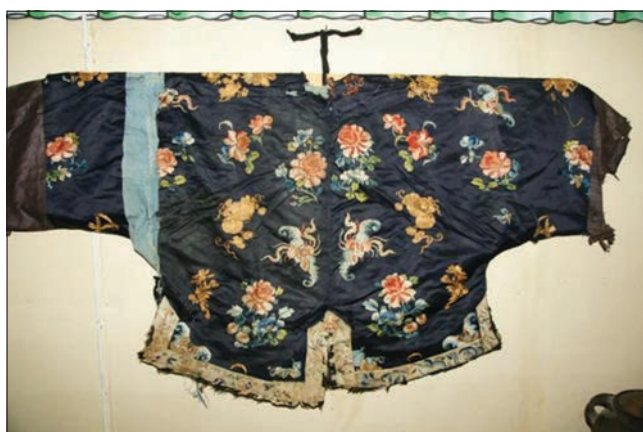
Figure 2. Qing Dynasty embroidered clothing from folk collections

of esteemed inheritors like Yang Huazhen are examined to understand how their efforts in innovation and dedication contribute to the broader market influence of traditional craftsmanship. Collaborative efforts with Yang Huazhen’s team will provide firsthand insights into the challenges and