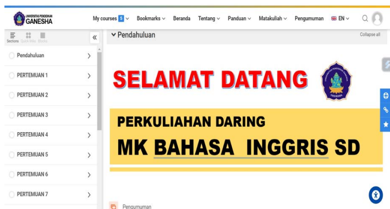
Figure 1. Homepage of task-based e-learning