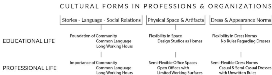
Figure 4. The relationship between cultural forms in educational life and professional life

All these aspects interconnect regularly and link with five cultural forms in professions and organizations: stories, language, social relations, physical space and artifacts, and dress and appearance norms (see Figure 4).