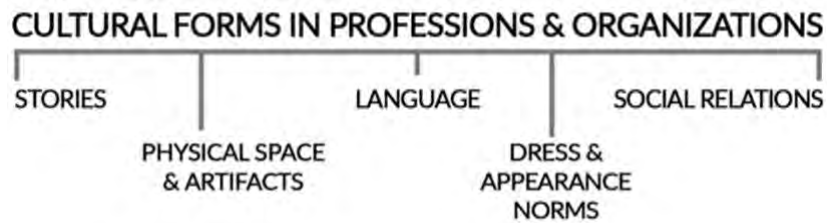
Figure 2. Cultural forms in professions and organizations