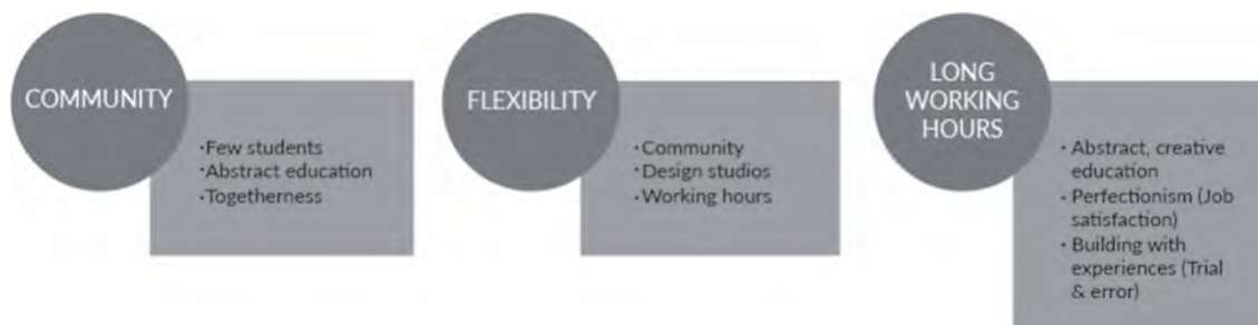
Figure 3. Aspects of professional culture in industrial design education

In professional settings, dress and appearance norms are the features that change the least among all the cultural forms. Manufacturing companies that are familiar with the design process and contain design departments that lead to industrial designers' flexible dress codes. While there are formal rules concerning appearance, industrial designers mostly dress almost identically to their academic years. In the interviews, industrial designers revealed their process of becoming industrial designers. With many examples, they demonstrated that their professional culture's foundations were laid from the beginning of their undergraduate education. According to the interviews, three main features create professional culture: 1) being a community, 2) flexibility in space and time, and 3) working for long hours (see Figure 3).