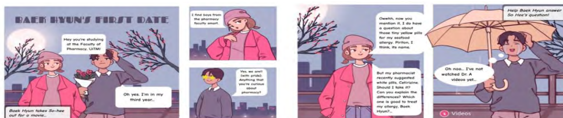
Figure 2: The CBL final puzzle on the medicinal chemistry of H 1 antagonists was presented in the form of a comic strip titled “Baek Hyun’s First Date” using a Genially theme

The background story of the final puzzle revolves around Baek-hyun, a pharmacy student in UiTM, who went on the first date with Soo-hee (Figure 2). Soo-hee asked Baek-hyun for some drug information; for instance, she wanted to know the differences in antihistamine drugs and which drug is best to take for her conditions. Trying to impress Soo-hee, Baek-hyun realised that he had to revise the topic on antihistamine drugs before he could answer her questions.