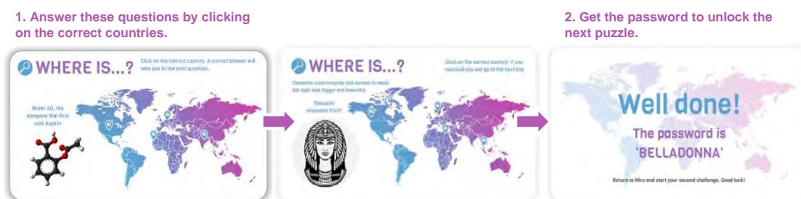
Figure 3: The warm-up questions of Puzzle 1 tested students on the origins of certain drugs or compounds with medicinal properties. If they answer all correctly, they would be able to obtain the password (e.g., Belladonna) to unlock the next task (Puzzle 2)

Right after the ice-breaking session, a 10-minute briefing was conducted to inform students about the rules and gameplay. The third-year students joined their own groups of 5-6 members, then went into their group breakout rooms in Cisco Webex. They were instructed to begin with the first puzzle (Figure 3). The questions in puzzle 1 were intentionally created to be as simple and straightforward; they served as warm-up questions to get students to familiarise with the Genially platform. When all questions were correctly answered, students would collect the password 'Belladonna' and use it to access puzzle 2 (Table 1). Google Forms, in quiz mode, was embedded at the end of each Genially puzzle for students to check-in. The forms captured students' progression as they moved in and out of the digital Genially puzzles during the online ER activity. To escape the MedChem Challenge, the time allocation for the teams was 40 minutes.