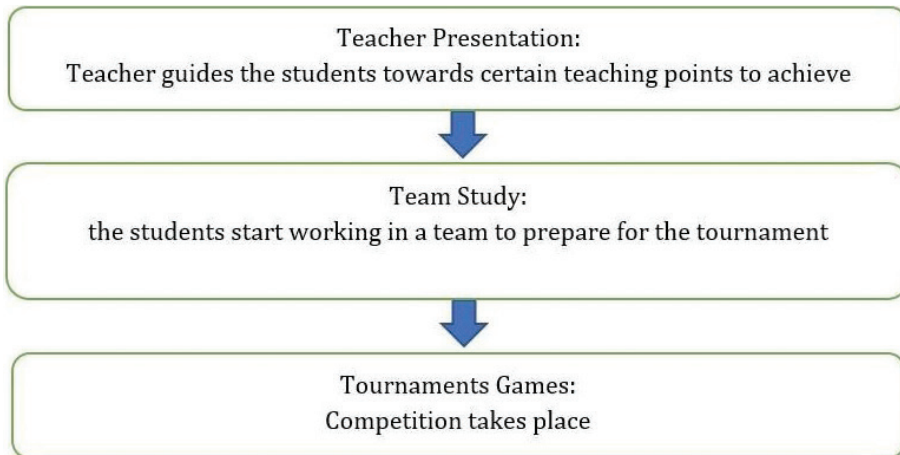
Figure 1. Stages of TGT.

phase, they discuss what they need to do and share tasks. The discussion helps promote their sense of responsibility and independence. They also start brainstorming to prepare for the last stage. In the last phase, the tournament games, students answer questions and pursue some activities to get to be the winner. This phase builds the students' confidence and the students from each team take turns to answer for equal participation.