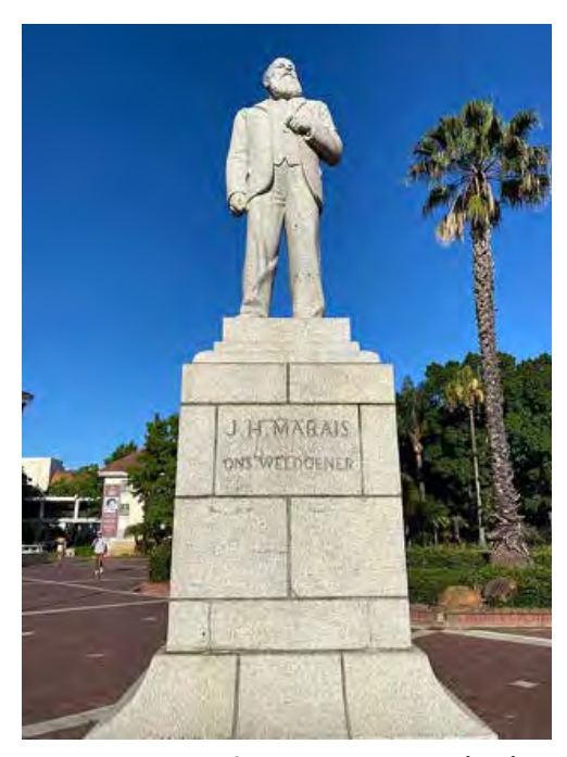
Figure 2: Statue of Johannes Henoch (Jan) Marais on the Rooiplein at the centre of the Stellenbosch campus of SU

In 2017, a VR Plan was written up based on students' projects and suggestions during the protests, and this was presented to the SU Rectorate, the management body of the SU. This plan was written into a