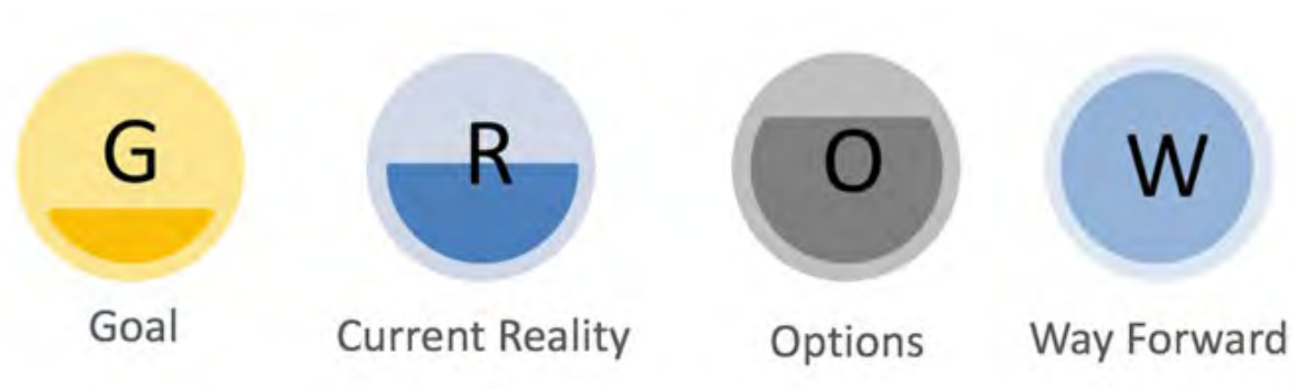
The Four Features of the GROW Model of Coaching

Note. The GROW Model is a method of coaching that focuses on setting and moving towards a goal via four steps: 1. Identify Team Goals (Goal); 2. Determine if goals are being met adequately (Current Reality); 3. For unmet goals, discover what is happening and what options are available moving forward (Options); and 4. Determine what action steps can be taken (Way Forward). Figure is sourced from Leach (2020).