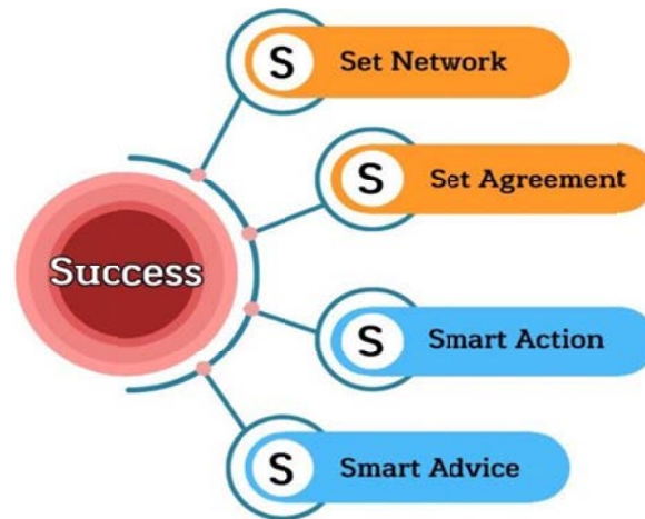
Figure 2. 5S MODEL

S1 = Set Network : Set up a network with qualified standard upright schools.