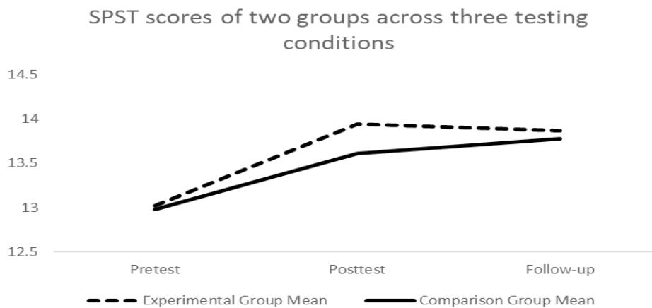
Figure 1 The Trends in Students' SPST Scores Across Three Testing Conditions

From Figure 1, it is evident that both EG and CG experienced an increase in their scores on SPST during the research than their SPST scores on the pre-test. Table 4 presents the mean CSCT scores of the groups throughout the research.