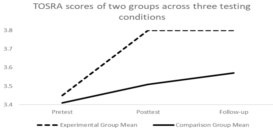
Figure 3 The Trends in Students' TOSRA Scores Across Three Testing Conditions

It is apparent from Figure 3 that although both teachings led to an increase in TOSRA scores at the post-test, by far, the most significant increase is for the EG that received HOS teaching. The difference was noticeable even five weeks after the completion of the research, favouring the EG. Further statistical analyses confirmed that the mean scores of the two groups differed significantly from each other: t(86) = 2.56, p = .012 , with a medium effect size ( \eta^2 = .07 ). Likewise, follow-up test scores of the EG were better than the CG, t(86) = 2.45; p = .016 , with a medium effect size \eta^2 = .07 . Table 6 shows the mean TOSRA scores during the research.