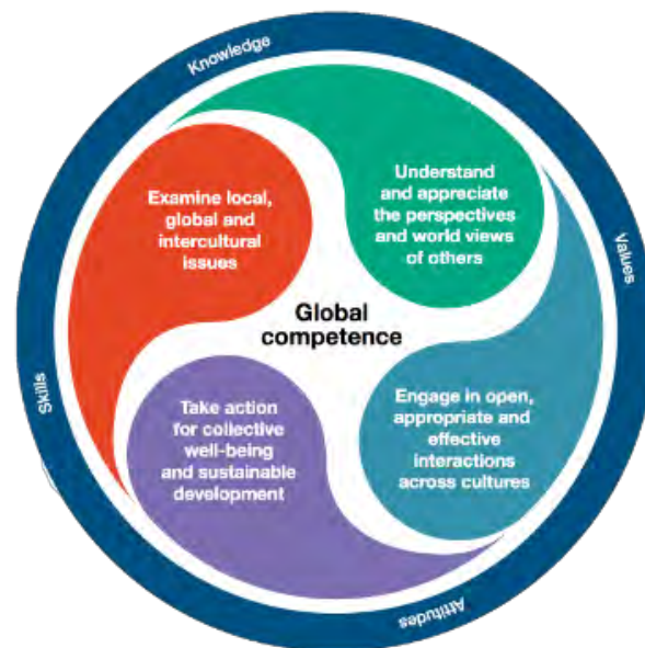
Figure 1. The Dimensions of Global Competence (OECD, 2018)

Thus, global competence promotes the Sustainable Development Goals (SDGs) by offering the educational perspective that the SDGs support and motivate youth to participate in the SDGs' general interests of sustainable development and collective well-being (Chandir, 2020). "Global citizenship" and "global competence" have been used interchangeably. Fernando Reimers, Veronica Boix-Mansilla, and Anthony Jackson contributed significantly to the definition of global competence that the OECD used. Consequently,ualizations of the term are especially pertinent today (OECD, 2018). According to Newman (2013), it is crucial to "figure out their common humanity and their differences with others" as people and nations grow more interdependent, connected, and involved in their contacts with people from diverse cultures. OECD (2018) identified three dimensions of global competence as follows.