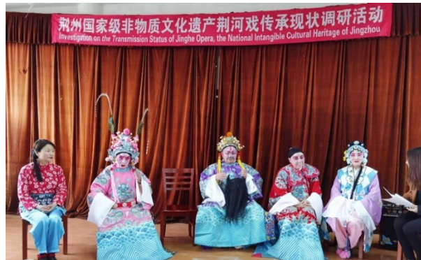
Figure 2. Interview the Key Informants

2.2.2 Data Collection: Semi-structured in-depth interviews will be conducted with each key informant to explore their perspectives on Jinghe Opera, contemporary transmission methods, and educational approaches. Open-ended questions suited to the informant's background and role will serve as a guide during interviews, as shown in Figure 2.