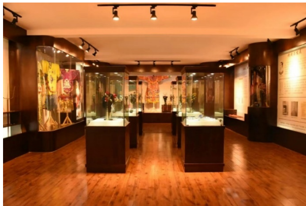
Figure 3. Jinghe Opera Museum, Yangtze University