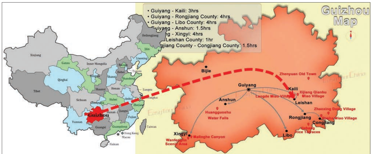
Figure 1. Map of research site