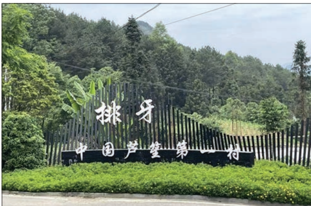
Figure 3. The construction of a Lusheng in Paiya village, Qian Dongnan, Guizhou Province

These strategic policies and community-driven initiatives, exemplified by the enterprising spirit of villages like Langde Miao, underscore the government's unwavering commitment to nurturing and preserving the cultural legacy of Lusheng. These initiatives not only bolster economic growth but also celebrate the profound cultural heritage embodied by the soulful melodies of Lusheng, ensuring that this cherished tradition continues to thrive and resonate across generations.