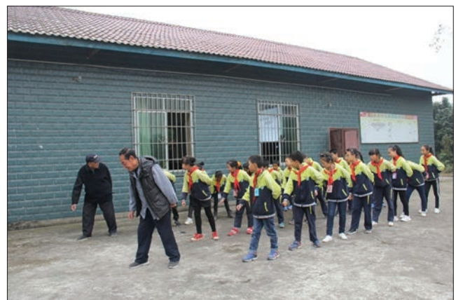
Figure 3. Yongning River Boatman Work Songs Promotion Academy

This topic discusses the importance of collaborative efforts involving local individuals, cultural centers, educational institutions, and government authorities in preserving and promoting these songs. The preservation and promotion of Yongning River Boatman Work Songs are not solitary endeavors but the result of collaborative initiatives that have brought together various stakeholders within the community. This section sheds light on the significance of community collaboration in conserving and propagating these cultural gems, as shown in Table 4.