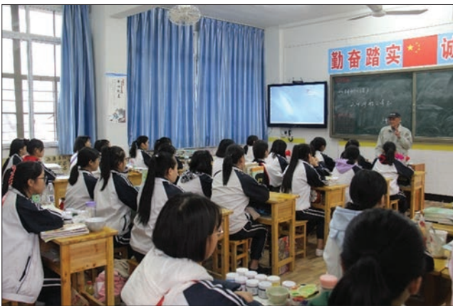
Figure 5. Transmission to the local students during the instructional session Source: Wenxing Wang, from fieldwork and drawn the map in March 2023

education, extracurricular activities, mentorship, technology, cultural events, and intergenerational interactions, the songs have found resonance among the youth, securing their continued transmission and enriching the community's cultural fabric, as shown in Figure 5.