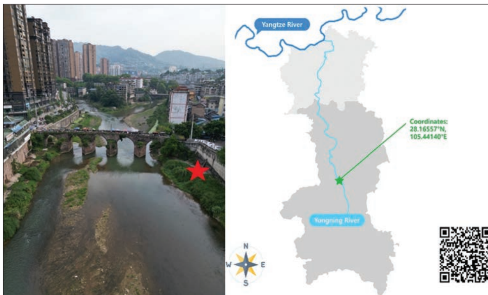
Figure 2. Yongning River, Xu Yong Dock