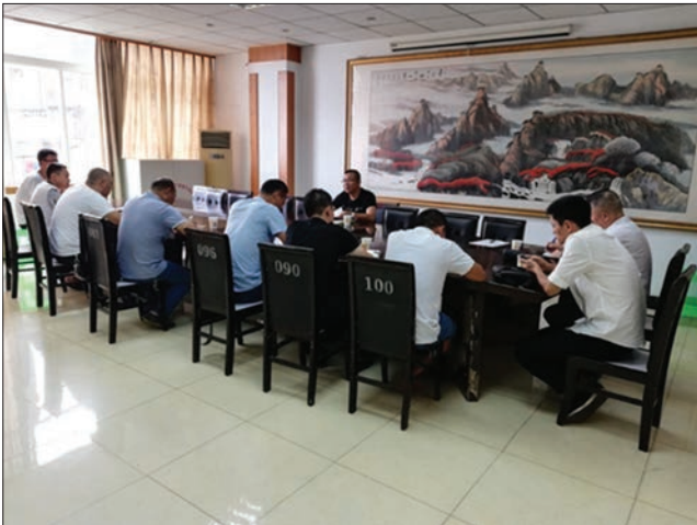
Figure 4. The Staff members of the Naxi District Cultural Center have convened a meeting Source: Wenxing Wang, from fieldwork and drawn the map in March 2023